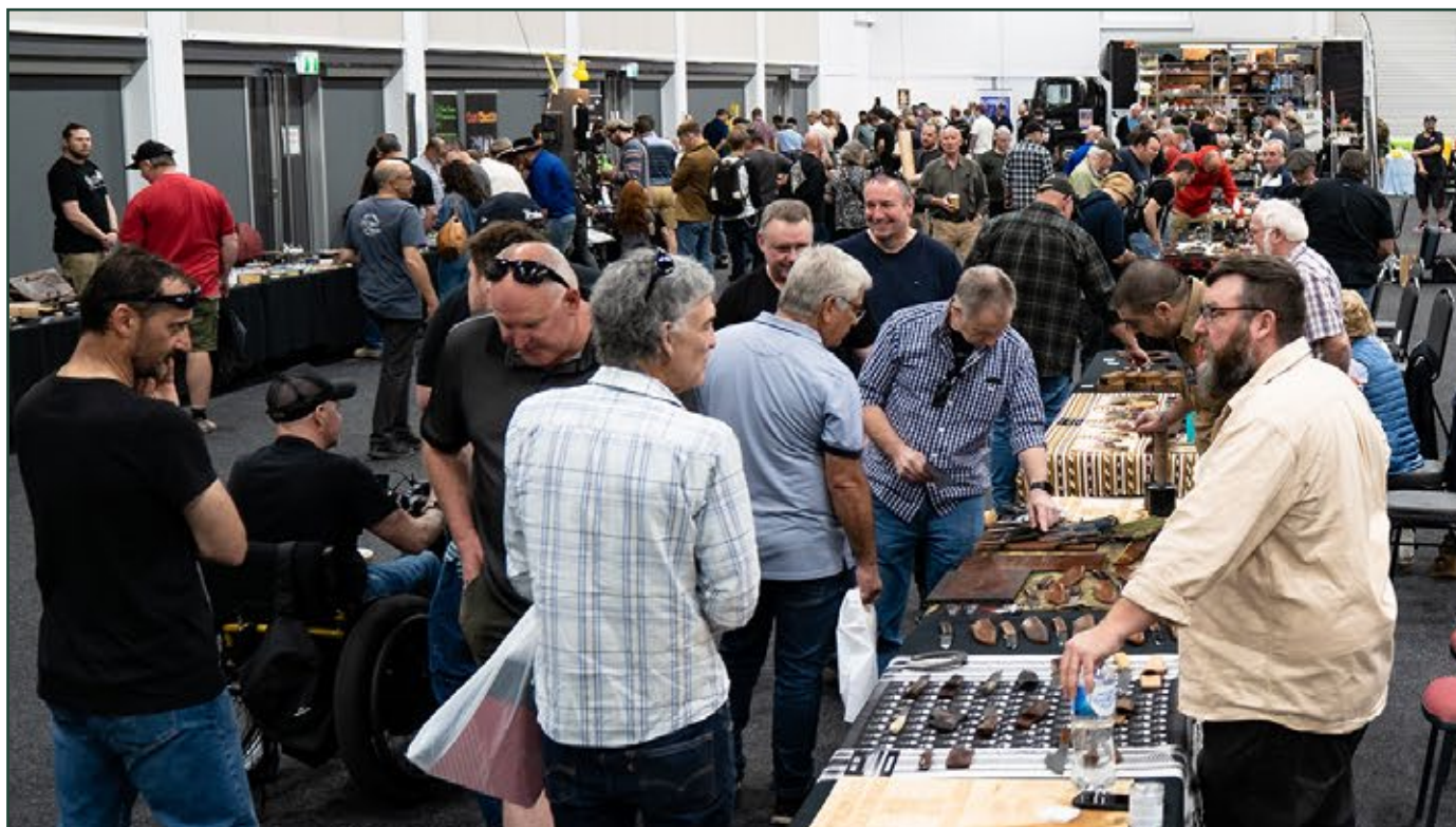
2022 Adelaide Knife Show - Ridley Centre, Adelaide Showgrounds